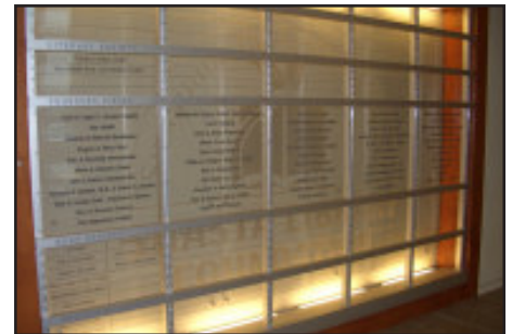
*Members of the Founders' Circle